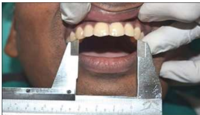
COMBINED WIDTH OF MAXILLARY ANTERIOR-CANINE POSITION