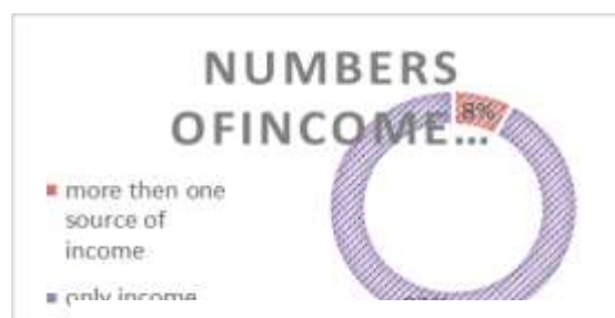
Income sources (Wealth ranking)