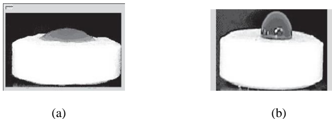
Fig.2 Photoimages showing contact angle of water with (a) Unsintered tablet. (b) Sintered tablet (Patwekar T S et al., 2014)

The duration of sintering also affected the porosity, the tablet sintered for less time shows more porosity as compared to the tablet sintered for more time (ChandanMohanty, 2011; Patel DM. et al., 2002) They also established that the contact angle of sintered tablet was greater than that of the unsintered tablet shown in Fig. 2. This clearly indicates that sintering decreases the wettability of the tablet. This higher contact angle also contributes to the retardation of drug release from matrix tablet.