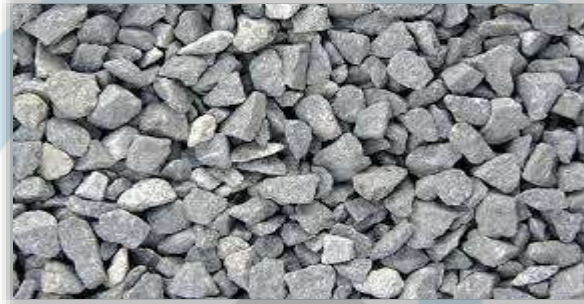
Fig. 1 (a) Natural Coarse Aggregate

Aggregate: The locally available river sand was used as fine aggregate and crushed quartzite aggregate of maximum nominal size of 20mm, was used as coarse aggregate as shown in Figure-1(a). The waste ceramic tiles used throughout this experimental study were gathered from the house construction site as shown in Figure-1(b).