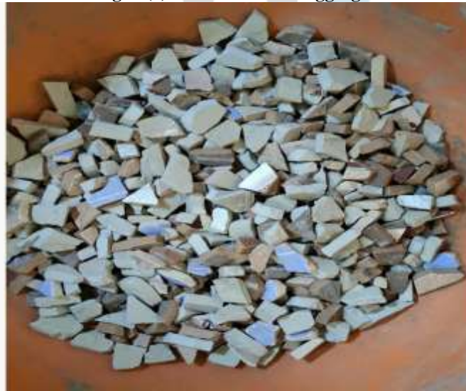
Fig. 1 (b) Waste Ceramic Tiles