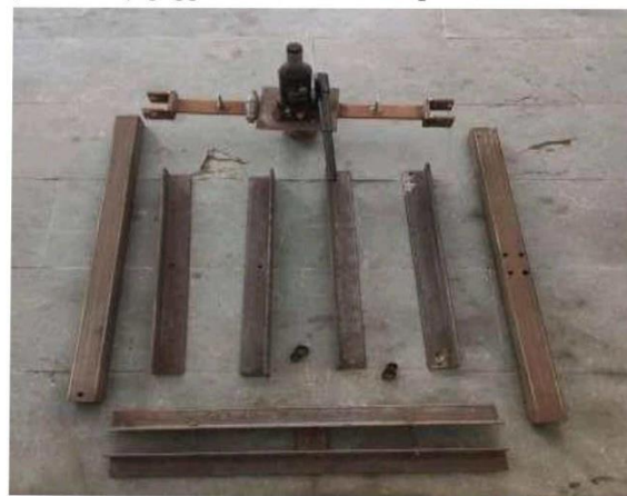
Figure 1.2 part of hydraulic manual press machine