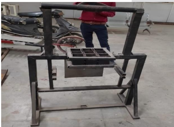
Figure 1.1 original frame

5 ton bottle jack and springs, We used 5 ton bottle jack to make this hydraulic press., Also I used 2 mechanical springs to allow the hydraulic jack in its first position. Both the hydraulic