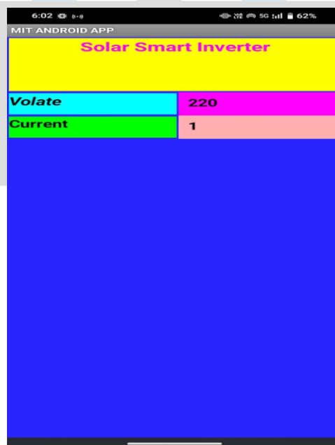
Fig. 3: Real-time voltage and current monitoring is displayed on the mobile application interface.

Under ideal operating conditions, the system demonstrates dependability, especially when solar input is available and the battery is sufficiently charged [4], [9]. Remote monitoring, which enables users to monitor energy consumption and make well-informed decisions for optimal energy use, is one of the system's main benefits [1], [5]. Nevertheless, the existing model's shortcomings include its inability to handle large loads, its lack of sophisticated automation, and its reliance on simple or manual control techniques [2]. Long-term stability and safety may also be impacted by the wiring configuration.