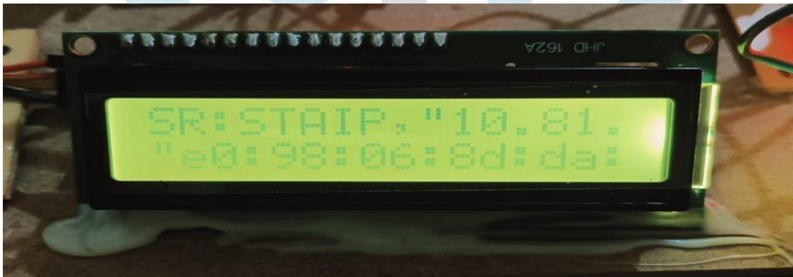
Display of ESP8266 IP Address on LCD Screen