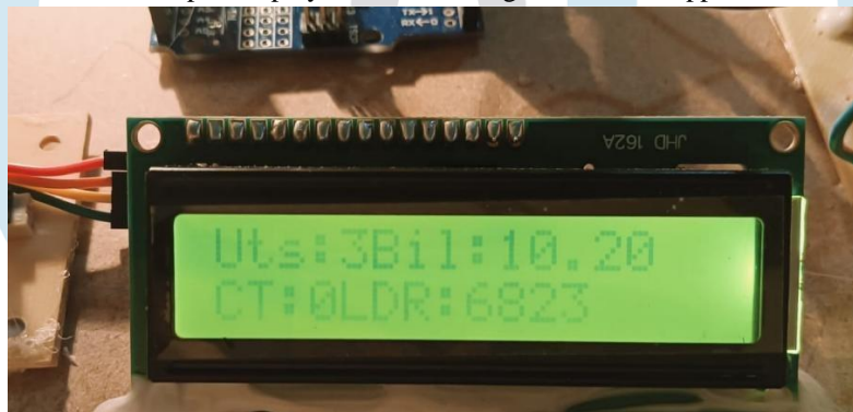
Real-Time Data Display on LCD Screen