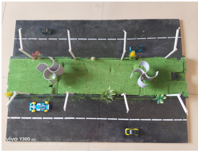
Fig -2: Vertical Wind Turbine Axis

When vehicles move on the road, they create airflow. This airflow hits the turbine blades and makes them rotate.