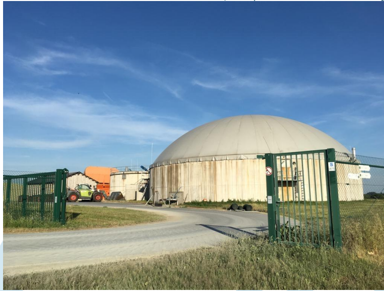
Picture 2: CSTR Semi dry fermentation process based plant operating in Germany