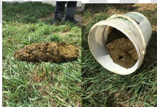
Picture 1: Substrate(thick sludge) with 16 % Dry matter post digestion

The digestate generated post digestion has close to 20 %DM (Dry matter) and 80% moisture. The digestate generated is in form a thick sludge which can be further dried and can sold as high value organic manure. There is no liquid slurry generated using CSTR based semi Dry fermentation process. The liquid slurry handling process is very minimal.